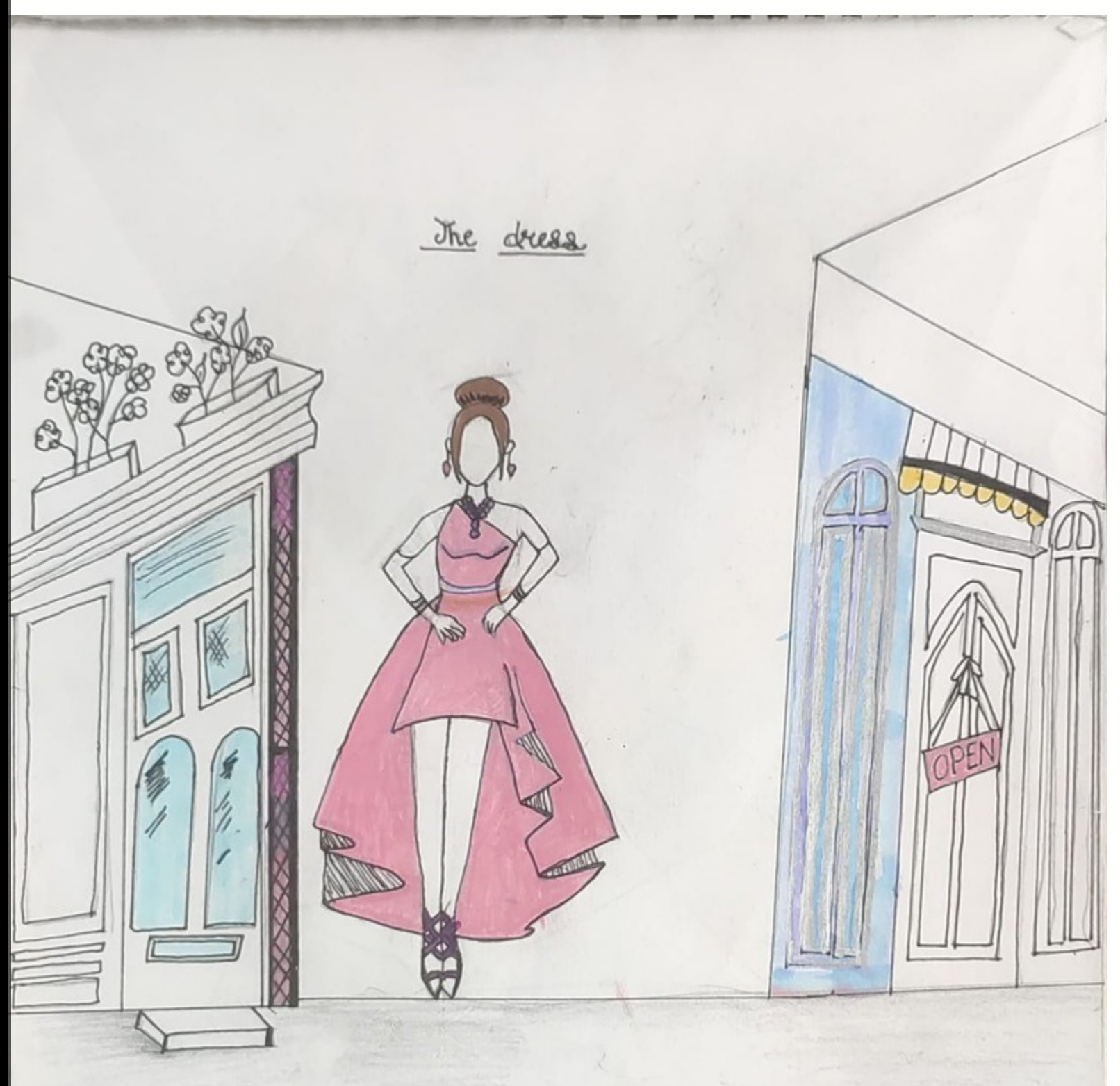
By-Vaneya Grade 6