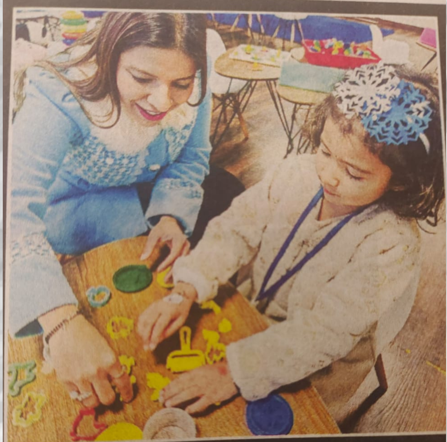
Learning, fun and happiness were witnessed at Manav Rachna International School, Mohali when children, along with their parents, explored the wonderful activities on frozen-themed 'play date'.