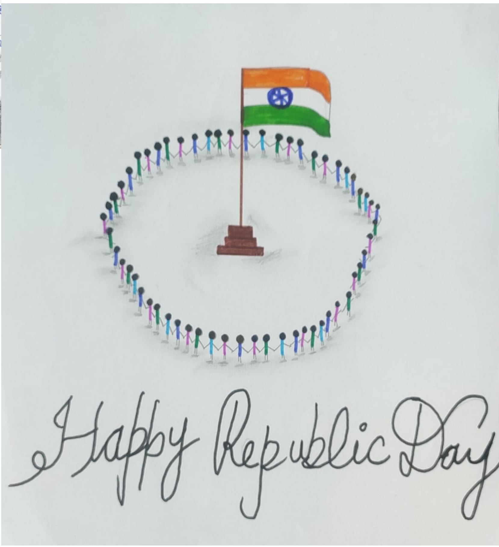
By-Siddhi Jakhar Grade 5 Tagore