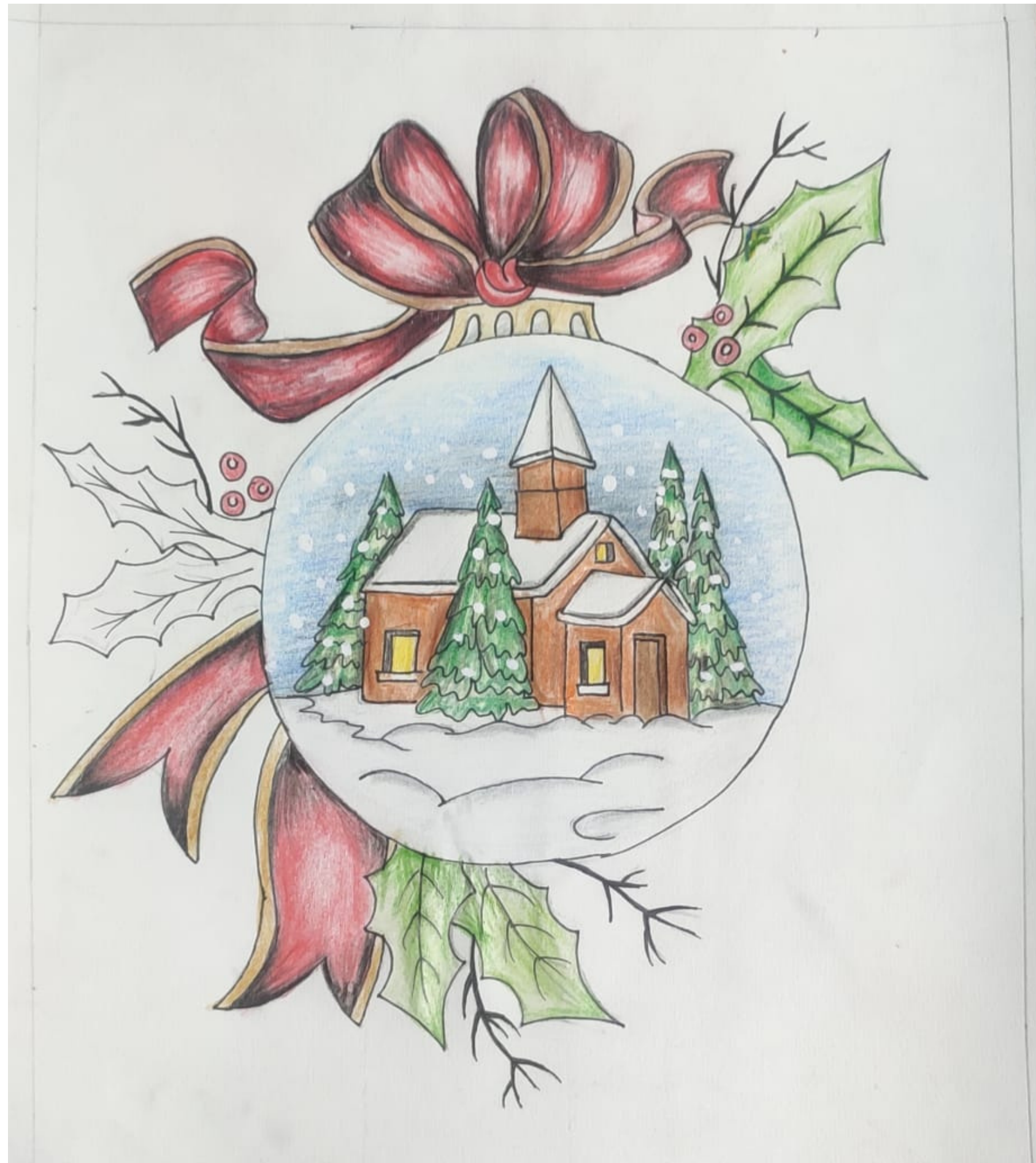
By- Samreen Grade 6 Achievers