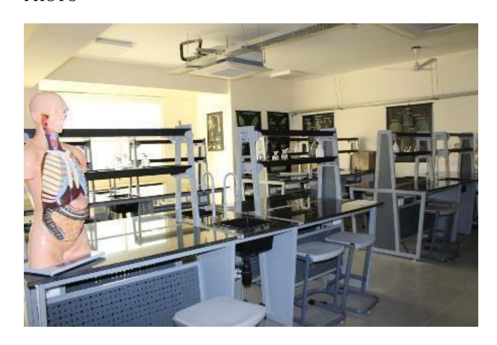
CHEMISTRY LAB PHOTO