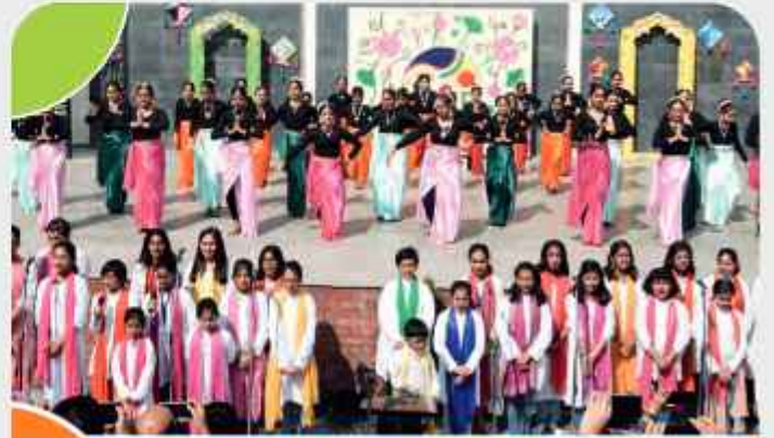
KALA SANYOJAN: ART FEST