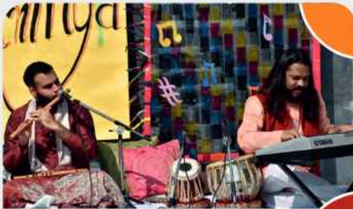
ZIMRIYA: MUSIC FEST