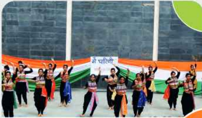
INDIA CALLING: INTER-SCHOOL COMPETITION