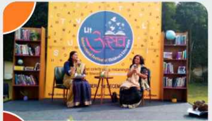
LIT UTSAV: LITERATURE FEST