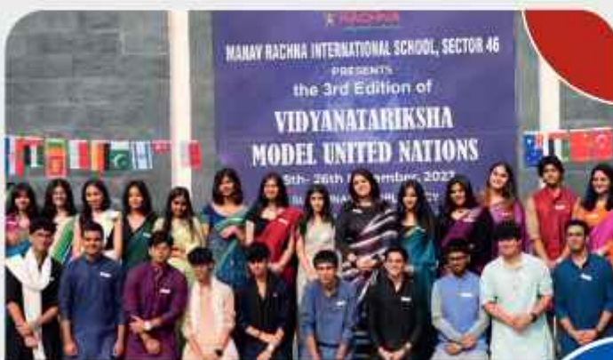
VIDYANATARIKSHA MODEL UNITED NATIONS